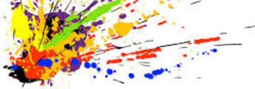
Sharing stories - Focused books (Supporting our curriculum aims)

We feel very strongly at pre-school that the joining in, exploring and the learning opportunity far outweighs trying to keep clothes clean. So please could we remind you to only send your child/ren in, in clothes that you are happy for them to get messy in. It shows you the fun that has been had!